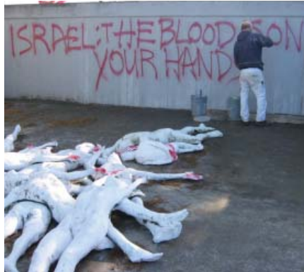
Cost: $1,492 Before graffiti abatement.

Between November 2008 and January 2009, this monument was vandalized extensively four times. The Recreation and Parks Department partnered with SFAC to address these multiple defacements, and they absorbed some of the associated costs. SFAC's work included removal of antisemitic graffiti on the back of a figure at the fence and on marble plaques (November 2008); Cleaning and in-painting of graffiti inscribed in forehead of central figure by a fine arts conservator (November 2008); cleaning and over-painting to cover extensive red spray paint to all figures and rear wall (December 2008); additional cleaning and over-painting of black spray paint on back wall and face of front figure (January 2009).