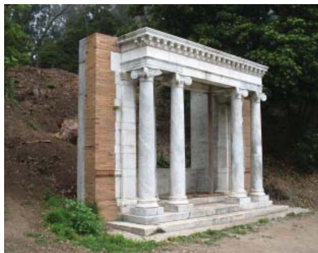
Portals of the Past Monument.

Artwork: Portals of the Past monument, 1909