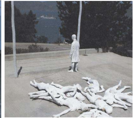
After vandalism removed.