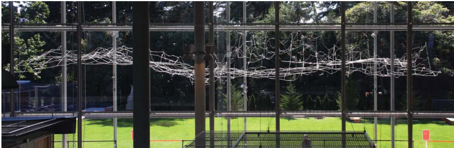
Maya Lin's stainless steel sculpture, Where the Land Meets the Sea

Total District Funding: FY 07: $179,600 FY 08: $1,436,995 FY 09: $1,619,770