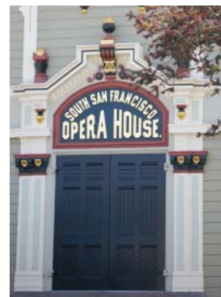
Bayview Opera House

Total PIC Grants in District Six $30,000