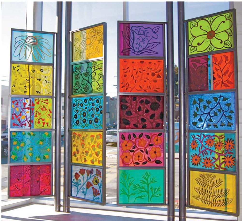
Dana Zed's California Wildflowers

Total District Funding: FY 07: $1,675,230 FY 08: $7,196,713 FY 09: $7,324,661