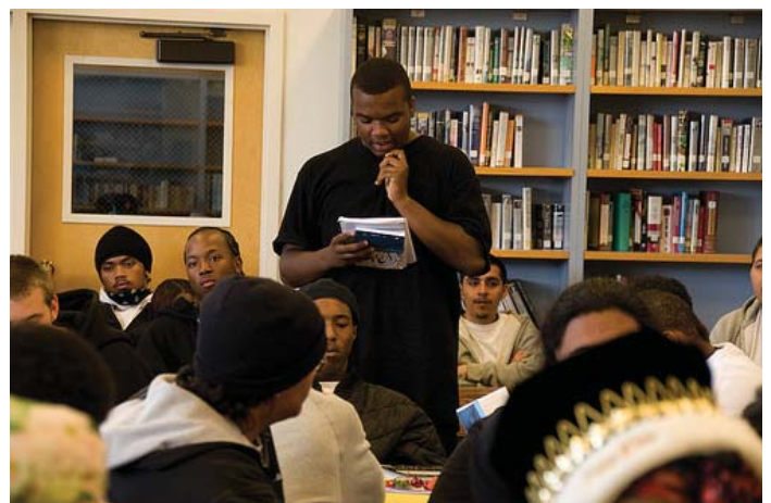
WritersCorps students at Downtown High School

WritersCorps works with 320 students at 10 sites teaching poetry, short fiction, interdisciplinary arts and performance; 75% of participants will demonstrate improvements in writing and increase their ability in self expression. In FY 08-09, WritersCorps also published two national anthologies ( Tell the World , HarperCollins; and Days I Moved Through Ordinary Sounds , City Lights); created 10 site projects including 3 books, 3 CDs of audio recordings, broadsides, and individual student chapbooks. A total of 15 readings throughout the year were held with a projected total audience of 2,500 people.