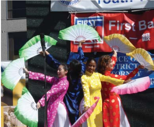
Au Co Vietnamese Cultural Center