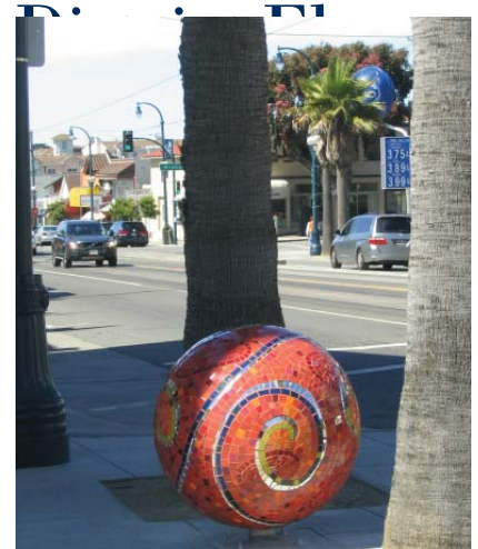
Sun Spheres , Laurel True