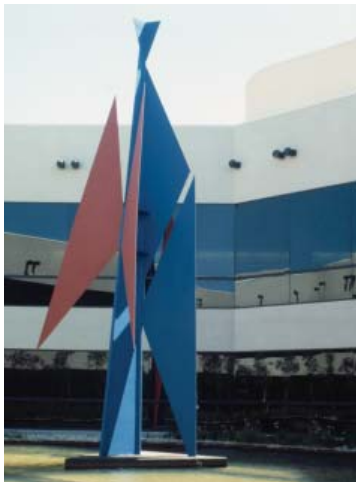
Rufino Tamayo's steel sculpture

Claire Rojas' artwork is inspired by folk art and Shaker images. Measuring 16' x 20', the image printed on 4' x 5' panels are hung from a picture molding.