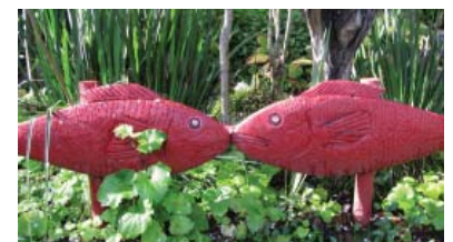
Demi Braceros wood carving