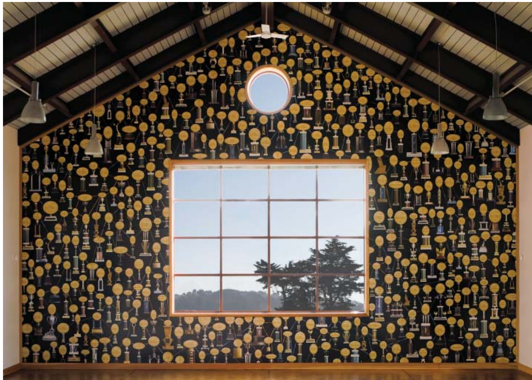
Imagine Even More by Joe Rubin and Jim Goldberg: Photo by Said Nuseibeh.

Total District Funding: FY 07: $327,100 FY 08: $328,600 FY 09: $441,750