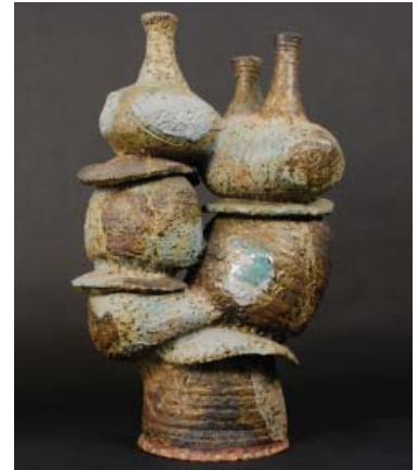
Jugs on Jugs by Robert Arneson 1960.

San Francisco International Terminal Main Hall was the location of the celebrated exhibition, The Art of a City: The History of the San Francisco Arts Festival 1946-1986 , which ran from October 11, 2008-April 10, 2009. A partnership between SFAC and the San Francisco Airport Museums, the exhibition featured selections from the Civic Art Collection representing four decades of acquisitions from the City's annual Arts Festivals.