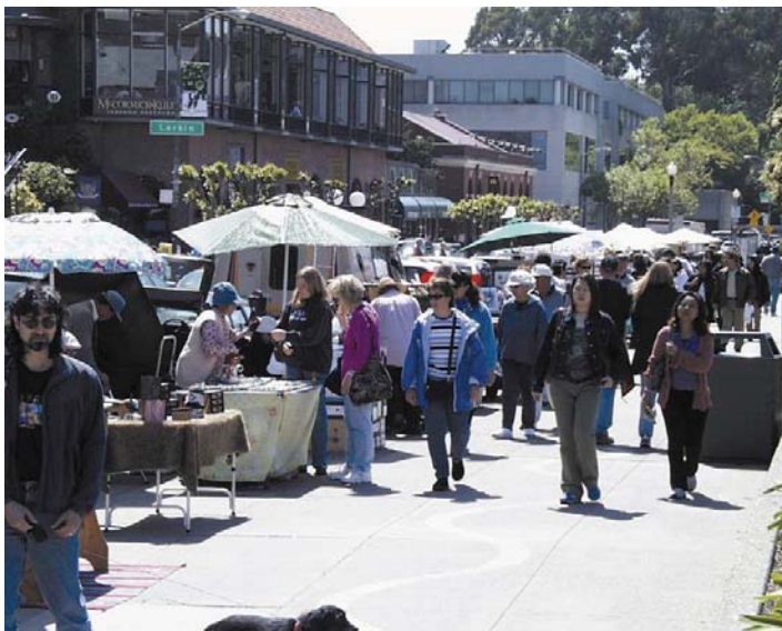
Street Artists Program

A total of 364 Street Artist Spaces throughout the City and County of San Francisco are designated by the Board of Supervisors for street artists licensed by the San Francisco Arts Commission.