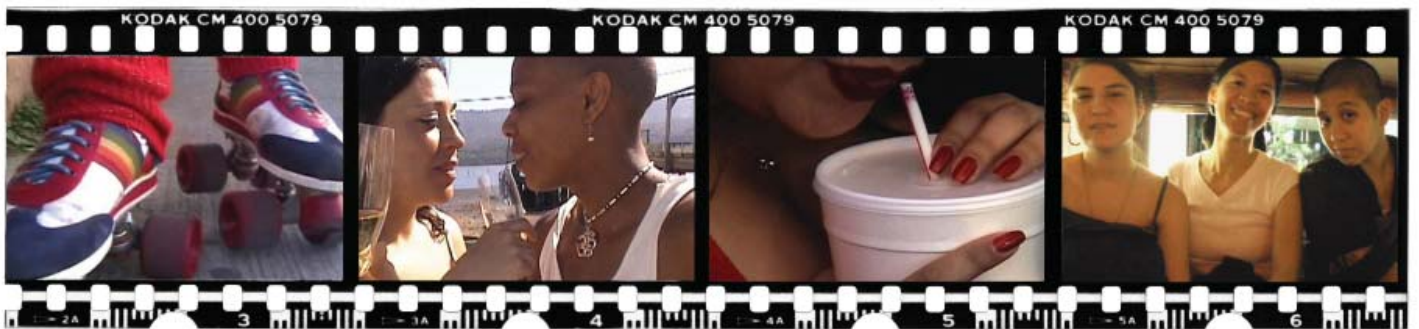
Queer Women of Color Media Arts Project

Total District Funding: FY 07: $1,007,600 FY 08: $1,184,500 FY 09: $1,079,000