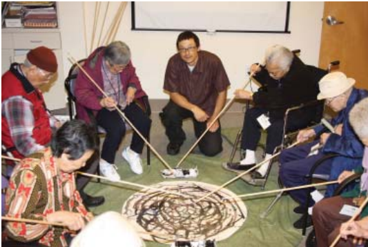
Institute on Aging