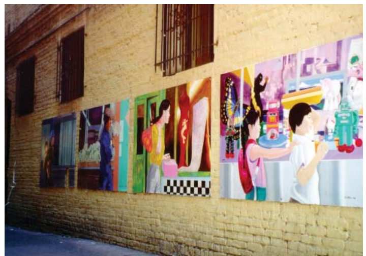
Chinatown Community Development Center