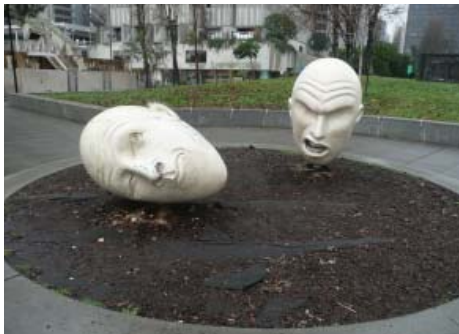
Yin Yang by Robert Arneson