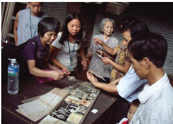
Chinese Culture Foundation of San Francisco