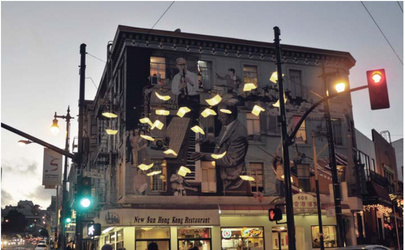
Language of the Birds by Brian Goggin and Dorka Kechn.

Total District Funding: FY 07: $2,213,650 FY 08: $17,026,940 FY 09: $2,245,400