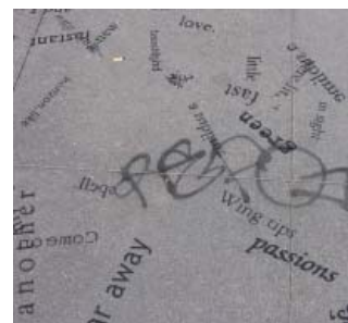
Language of the Birds