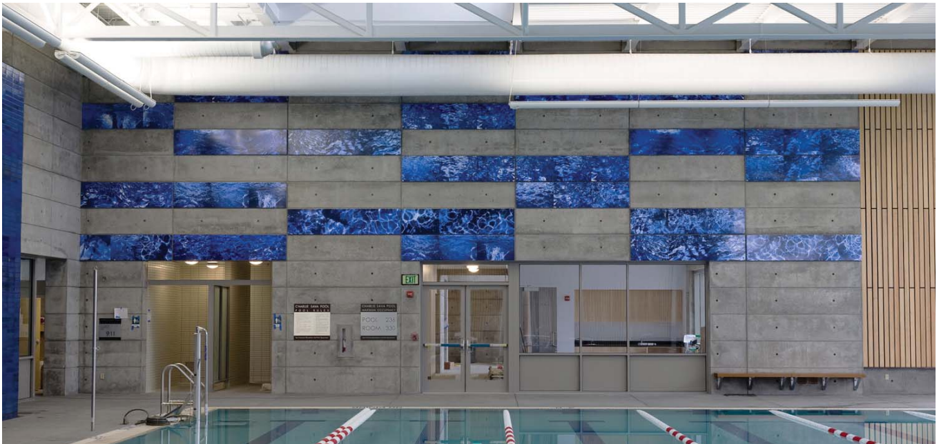
Swimmers' Waves by Catherine Wagner.

Total District Funding: FY 07: $165,500 FY 08: $137,359 FY 09: $206,200