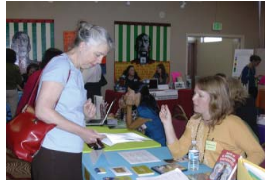
Arts Education Resource Fair

October 15th, 2008 at the African American Art and Culture Complex Sponsored in collaboration with the Arts Providers Alliance of San Francisco, more than 45 exhibitors gathered and shared their arts education program offerings to SFUSD arts coordinators, teachers, principals and families.