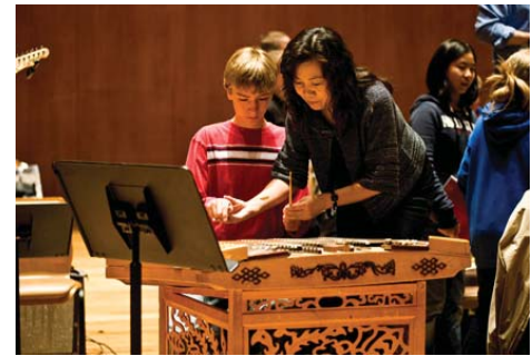
above: Fifth Stream Music Education Program