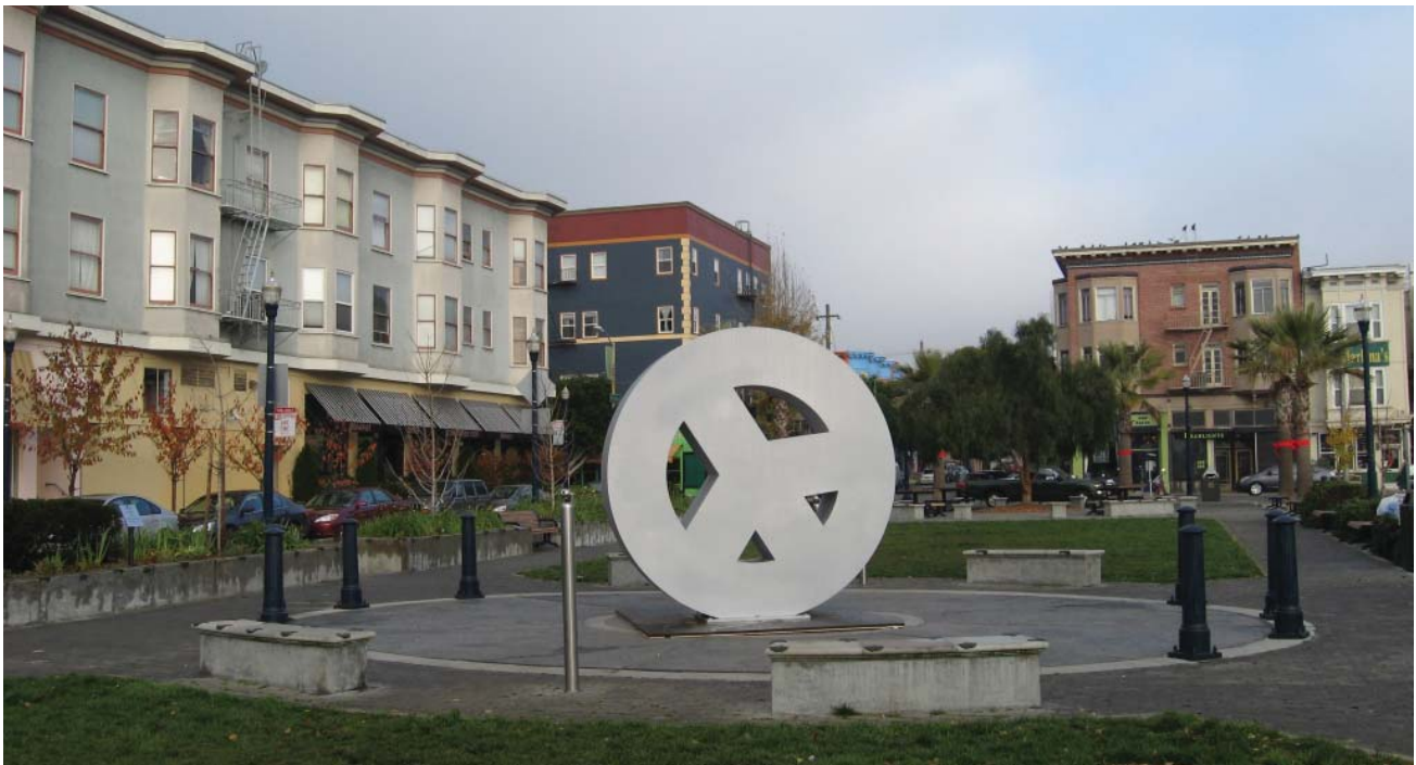
Big Peace IV by Tony Labat

Total District Funding: FY 07: $1,034,304 FY 08: $961,721 FY 09: $814,279