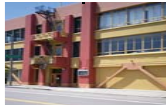
African American Art and Culture Complex