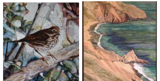
Above: Projects underway for Laguna Honda Hospital