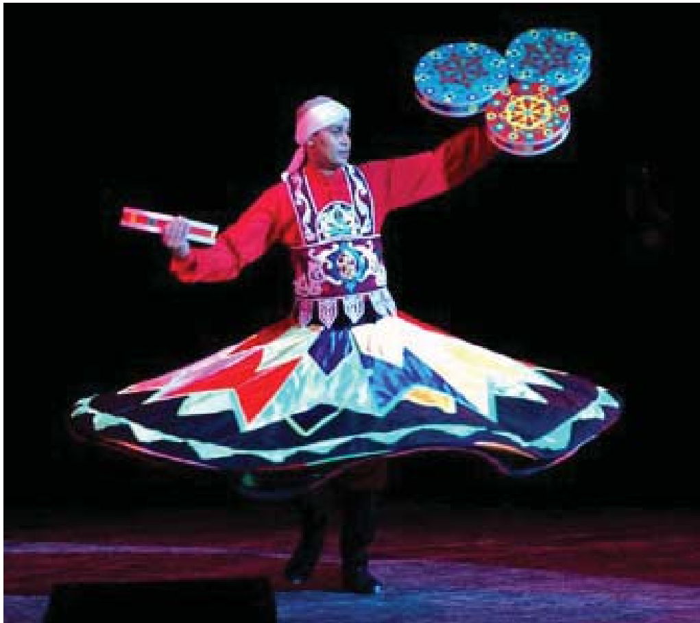
Arab Cultural and Community Center

Total District Funding: FY 07: $3,426,500 FY 08: $3,606,431 FY 09: $3,336,694