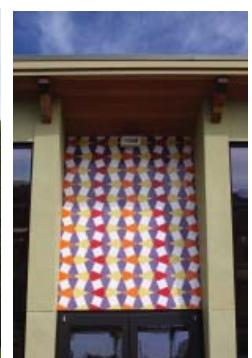
Bean Finneran's tile murals

Project: JP Murphy Clubhouse, Woman with Birds