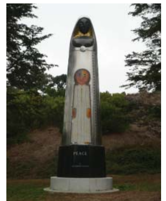
Peace , Beniamino Bufano