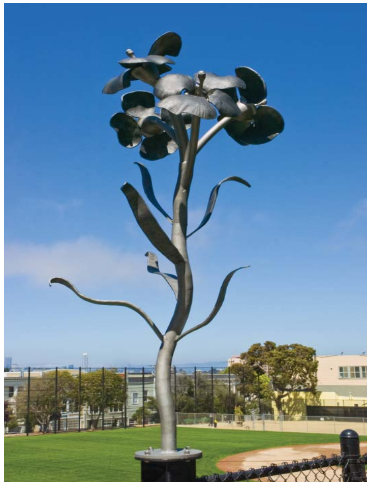
Troy Corliss's Noe Valley Natives

Total District Funding: FY 07: $311,484 FY 08: $309,565 FY 09: $434,842