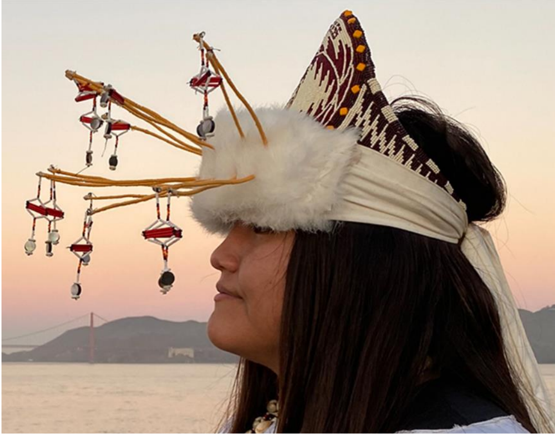
Round Valley Dancer