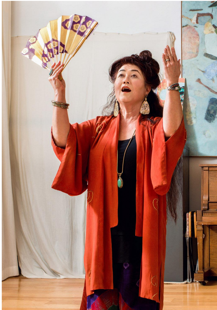
2020 First Voice