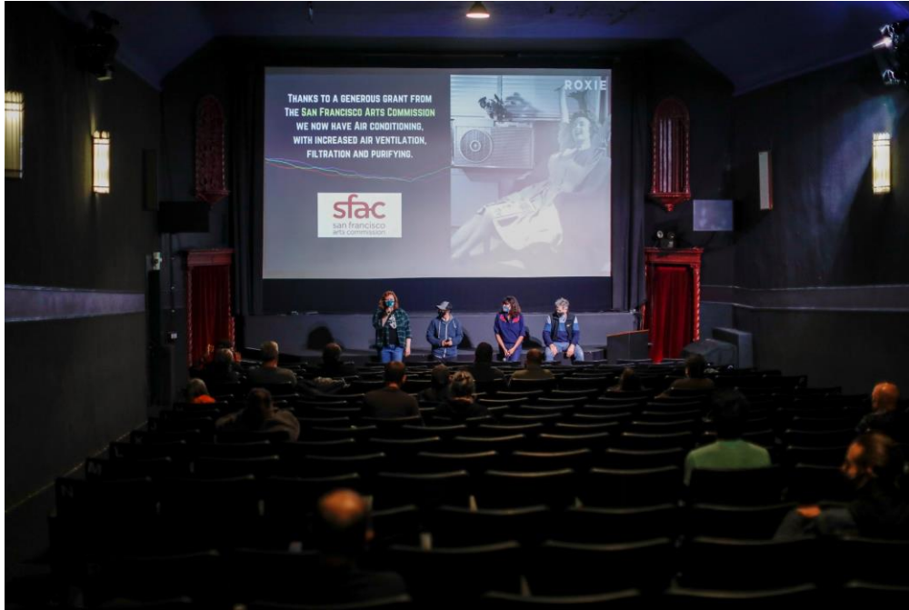
CRSP 2020 The Roxie Theatre

Supports arts organizations to plan for and invest in San Francisco cultural facilities.