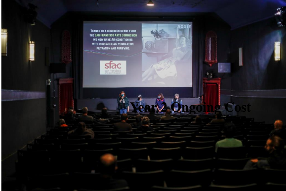
CRSP 2020 The Roxie Theatre

Supports arts organizations to plan for and invest in San Francisco cultural facilities.