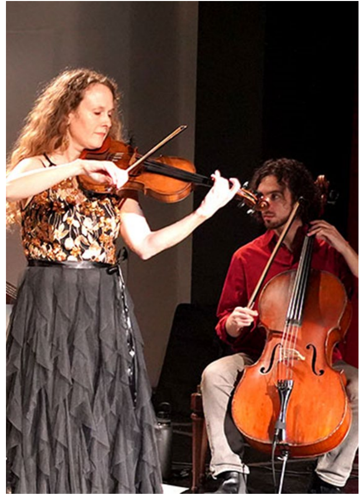
2020 Cultural Center Mission Cultural Center for Latino Arts String Quake Concert