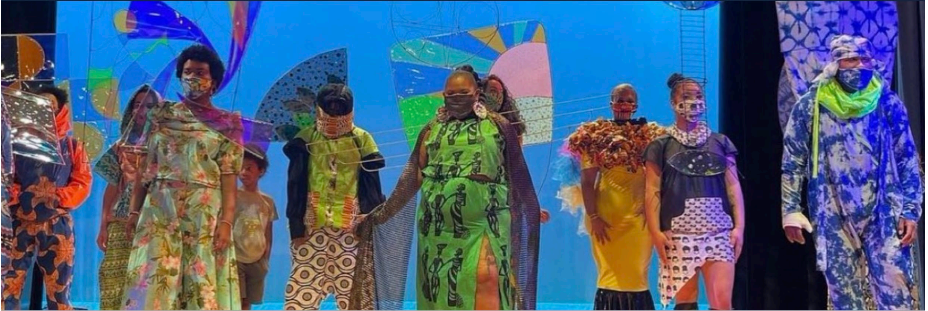
Afatasi, Blending Worlds Fashion Show