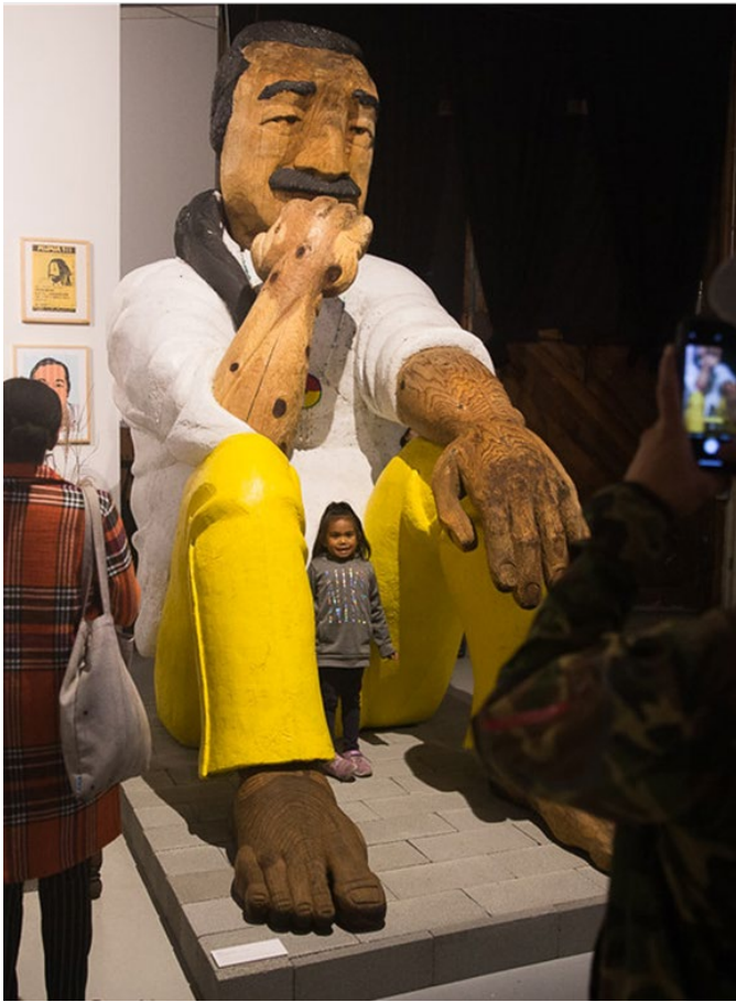
2020 Cultural Centers SOMArts

The San Francisco Arts Commission is the City agency that champions the arts as essential to daily life by investing in a vibrant arts community, enlivening the urban environment and shaping innovative cultural policy.