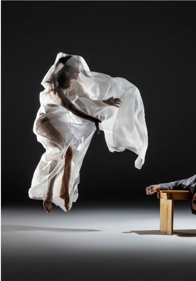
2020 SPX Dancer's Group