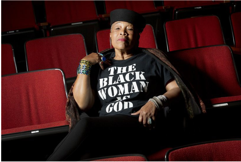
Rhodessa Jones at the African American Art & Culture Complex in San Francisco.