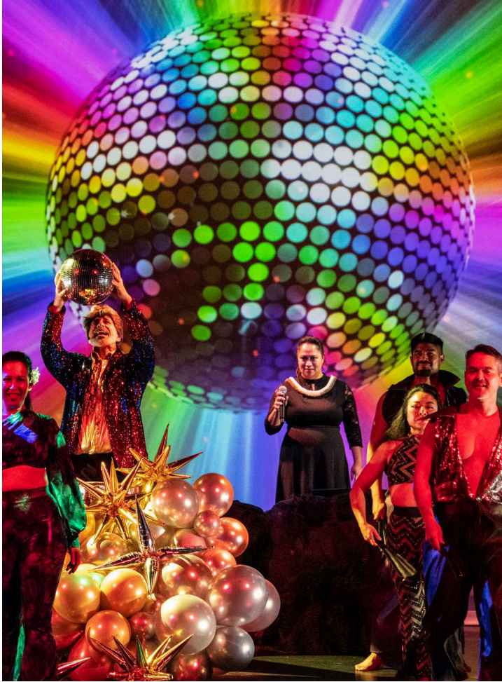
2022 Cultural Equity Initiatives, Nā Lei Hulu I Ka Wēkiu