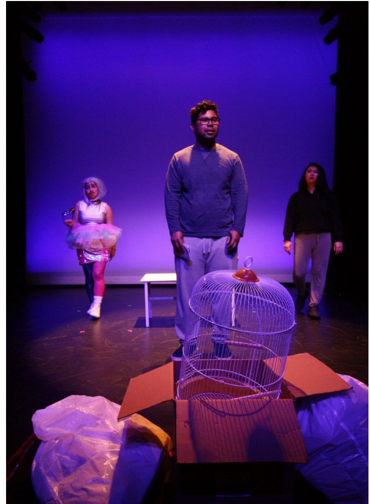
PlayGround, Free-Play Festival, photo by Lana Richards