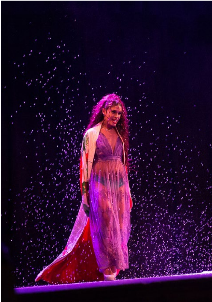
SOMArts, Thinking of You

The San Francisco Arts Commission is committed to creating a city where all artists and cultural workers have the freedom, resources and platform to share their stories, art and culture and where race does not predetermine one's success in life. We also acknowledge that we occupy traditional and unceded Ohlone land. Fueled by these beliefs, we commit to addressing the systemic inequities within our agency, the City and County of San Francisco and the broader arts and culture sector. This work requires that we focus on race as we confront inequities of the past, reveal inequities of the present and develop effective strategies to move all of us towards an equitable future.