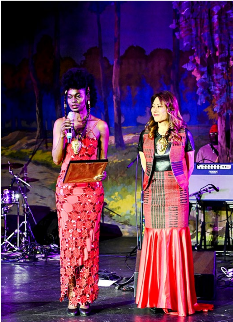
African Arts Academy