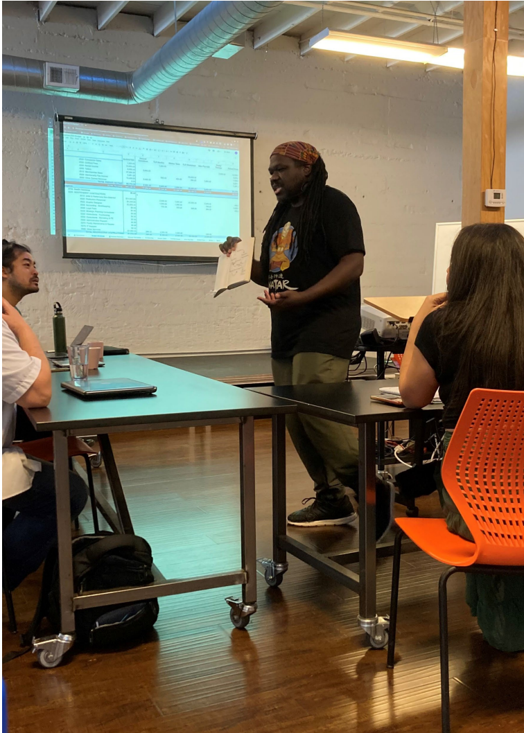
Intersection for the Arts - The Living Room - Kevin Dublin