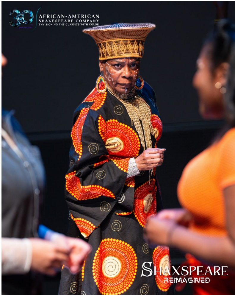
African-American Shakespeare Company