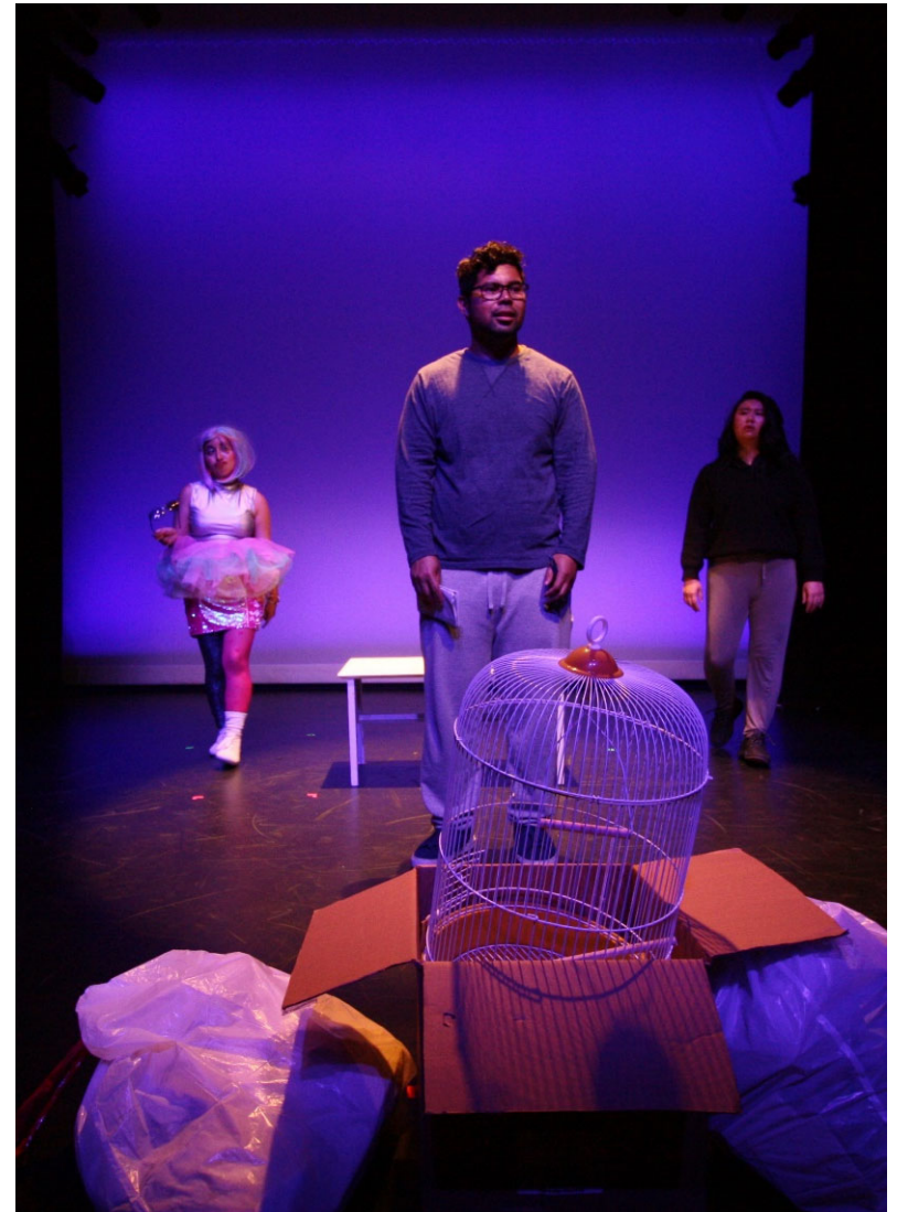
PlayGround, Free-Play Festival