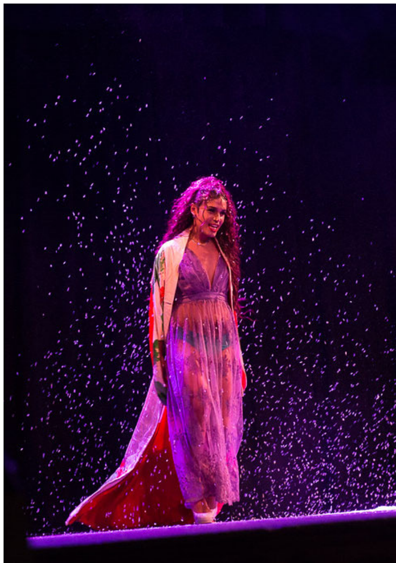
2020 Cultural Centers SOMArts, Thinking of You

The San Francisco Arts Commission is committed to creating a city where all artists and cultural workers have the freedom, resources and platform to share their stories, art and culture and where race does not predetermine one's success in life. We also acknowledge that we occupy traditional and unceded Ohlone land. Fueled by these beliefs, we commit to addressing the systemic inequities within our agency, the City and County of San Francisco and the broader arts and culture sector. This work requires that we focus on race as we confront inequities of the past, reveal inequities of the present and develop effective strategies to move all of us towards an equitable future.