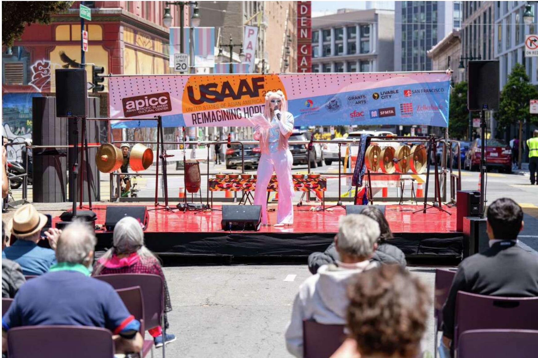
Asian Pacific Islander Cultural Center at Sunday Streets