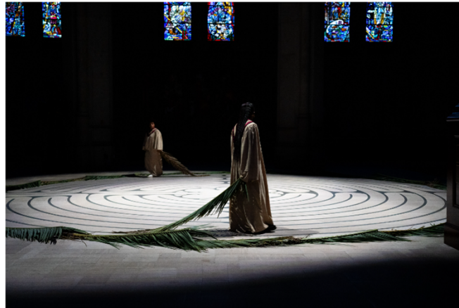
OYSTERKNIFE at Grace Cathedral, QCC FY23-26

Please sign up for our newsletter to stay informed about any grant program updates.