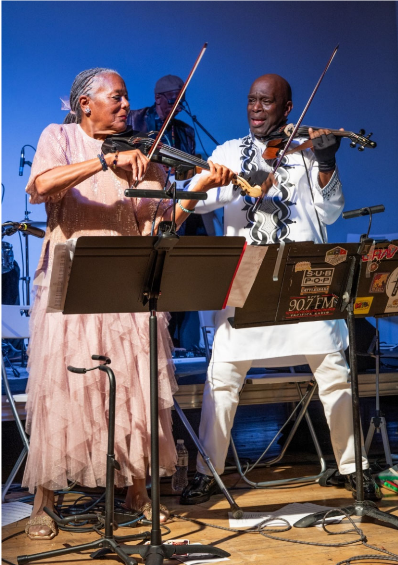
Idris Ackamoor and Cultural Odyssey