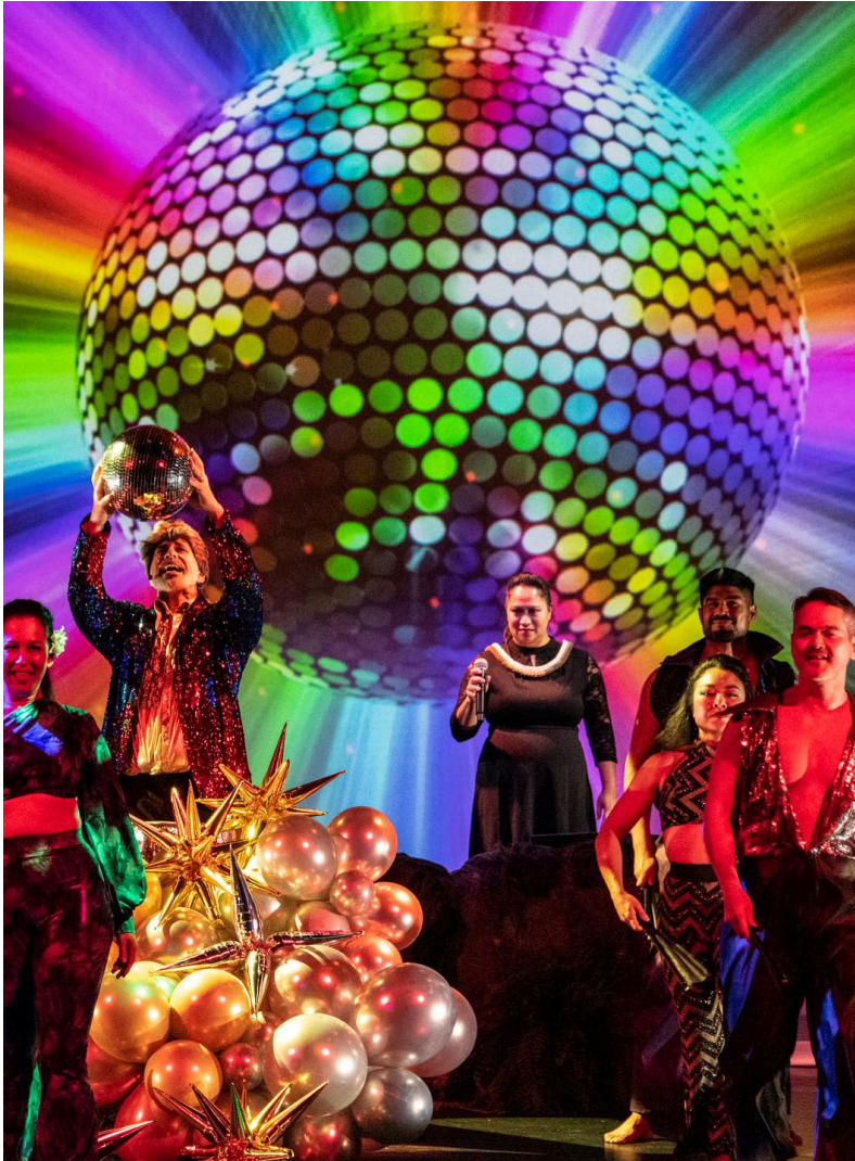
2022 Cultural Equity Initiatives, Nā Lei Hulu I Ka Wēkiu