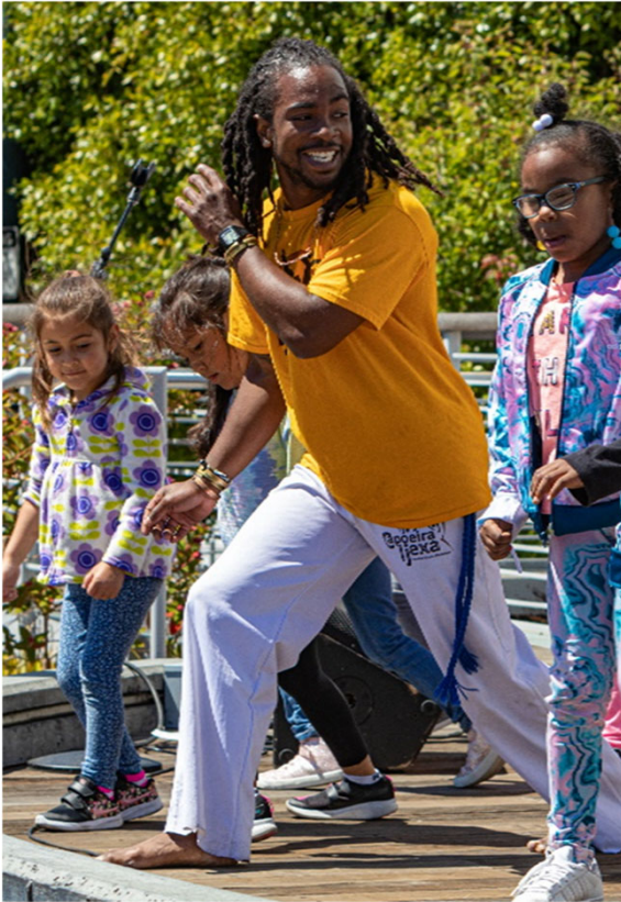
2020 Cultural Centers Bayview Opera House Capoeira, July 2019