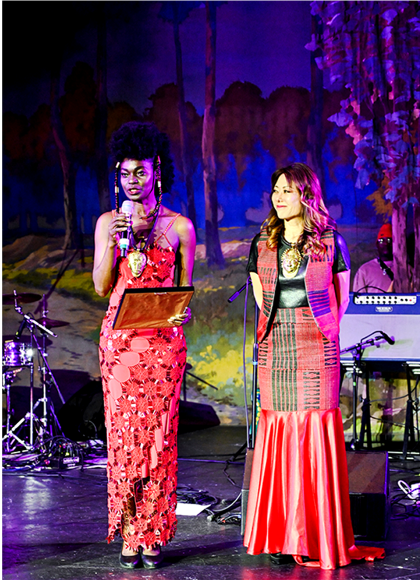
23CEI02 African Arts Academy