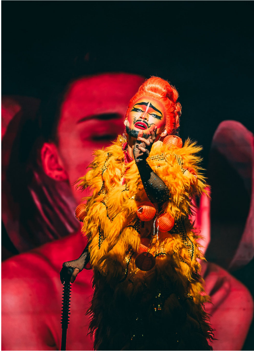
22CEI Kearny Street Workshop King Lotus Boy at KSW