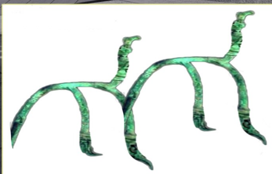
View of Branch. Eight branches total, each branch is 3-4 ft.