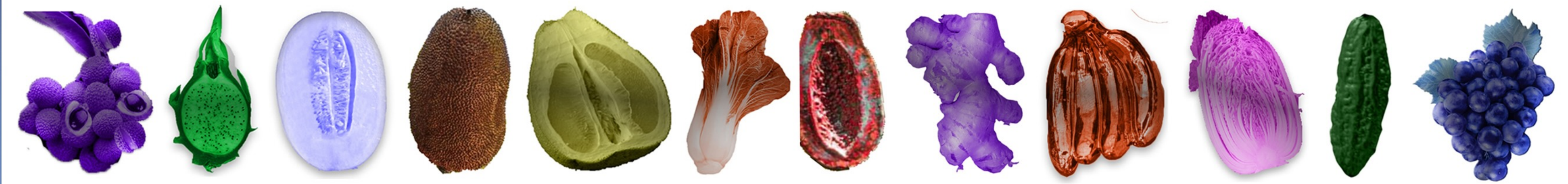
Example fruits: lychees, dragon fruit, hami melon, jackfruit, pomelo, bok choy, papaya, ginger, bananas, napa cabbage, bittermelon, and grapes. Fruits are made of aluminum and coated with colorful polyurethane paint with a protective clear coating.