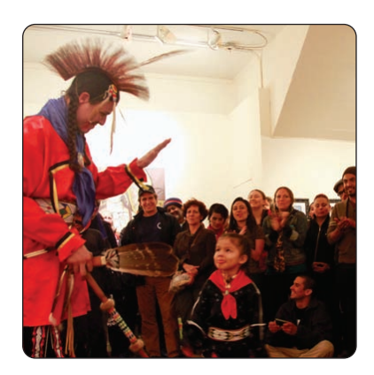
Native American Event Galeria de la Raza